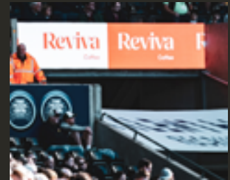
CORNER TUNNEL LED