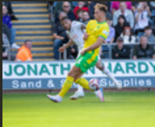
STATIC ADVERTISING BOARDS