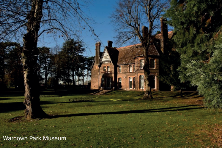
Wardown Park Museum