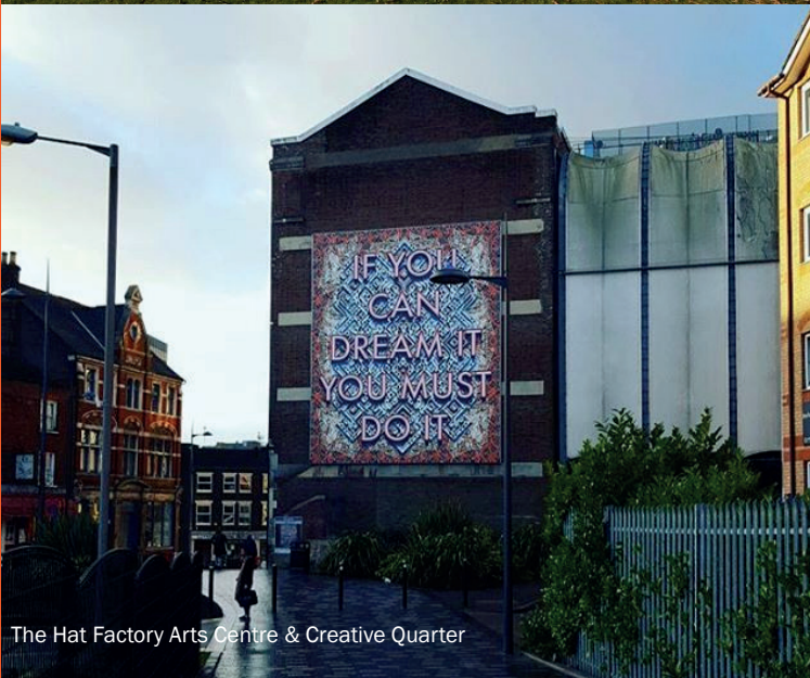
The Hat Factory Arts Centre & Creative Quarter