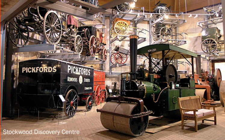
Stockwood Discovery Centre